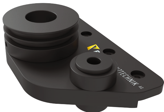
EQUIPPED PLATE WITH ADAPTER